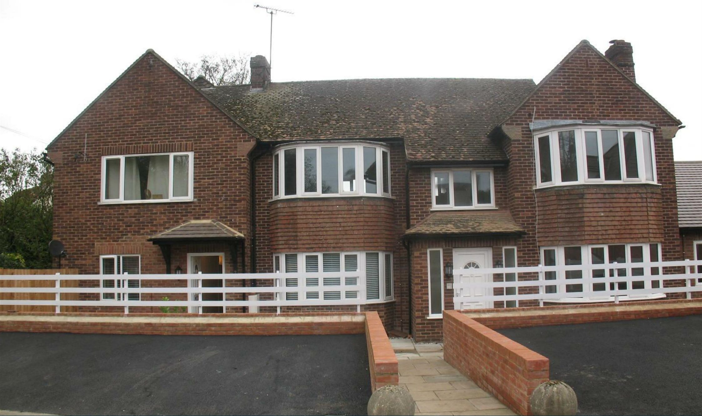
Dairy House, Haverhill, CB9 8EH